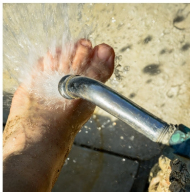
Disinfect or clean your blister